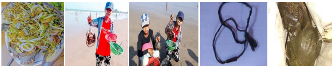
Plate 1. Occurrence of horseshoe crab salad and traditional usage found in local

price in Myanmar for exporting to borderline countries. Local people have less awareness regarding the horseshoe crabs and their importance to conserve the biodiversity in global level. Some local inhabitants were keeping telson of horseshoe crabs for massaging with this spine on their body (the treatment of traditional massage). Some people were selling horseshoe crabs to visitors for releasing back it to the sea or kept it in their home to be lucky in their life. Some local people took piece of telson of horseshoe crabs tied with cotton ropes and put it on legs or arm of their children to be healthy. The highest percentage of horseshoe crab individuals was Ma-San-Pa (29%) followed by Kyun-Su (20%) but the percentage of male was greater than female in all study sites.