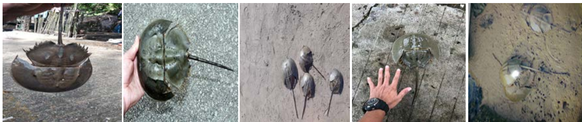
Plate 2. Catching horseshoe crab from landing sites collected by fishermen