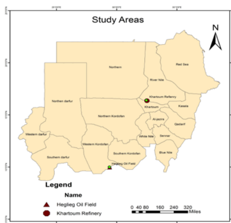
Map of the study area

The study area landscape is located in the semi desert zone north of Khartoum State, at latitude 16.4023N, 16.1157N. longitude 32.4609E, 32.2086E. According to Andrews (1949), Harrison and Jackson (1948a) the area is the semi desert grassland on sand in places with a thin scatter of Acacia raddiana , A. mellifera and Commiphora spp. The rainy season begins in July the end of September. The dry season begins in December and last June. The rainfall, is about 164 mm per year. The annual minimum temp, average 29.6°C and maximum 38°C.