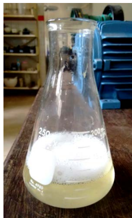
Figure 4 : Additive

The produced additive was able to form a microbubble system with the \text{CO}_2 released in the acid - base reactions retained inside, in a partially stable way. See Figure 4.