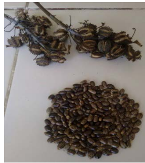
Figure 1: The raw material

The collected fruits were left in the sun to dry and hatch, and then the seeds were stored in plastic bags until the time of their use. The storage should always be done in a dry and ventilated place. Figure 1 shows the dry, ready-to-use seeds, which is the raw material for this process.